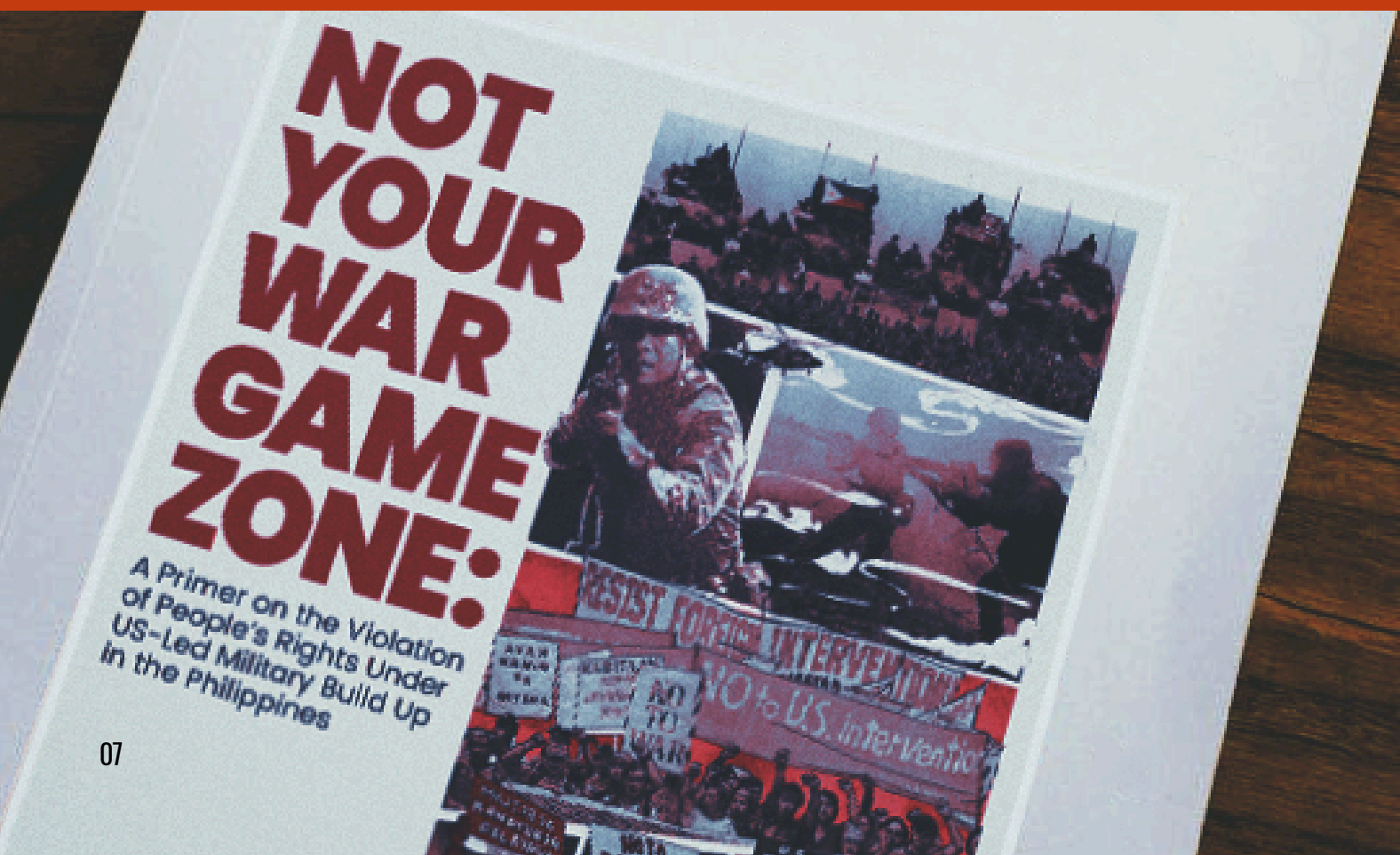
Not Your War Game Zone Primer Cover Image

In response to the heightened militarization and aggressive war games like the Balikatan exercises, ICHRP members around the world mobilized to oppose their own government's complicity.