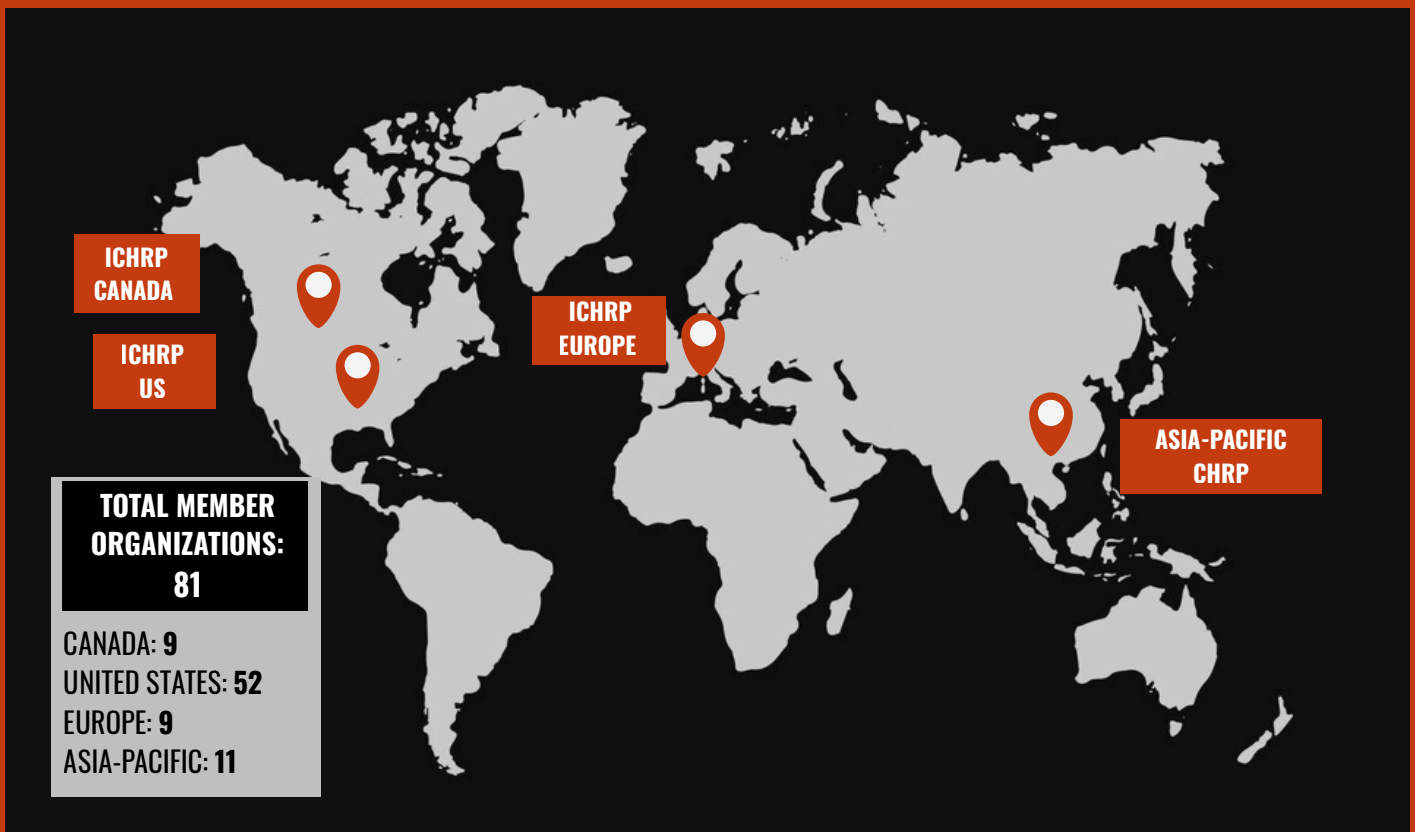
ICHRP member cities around the world