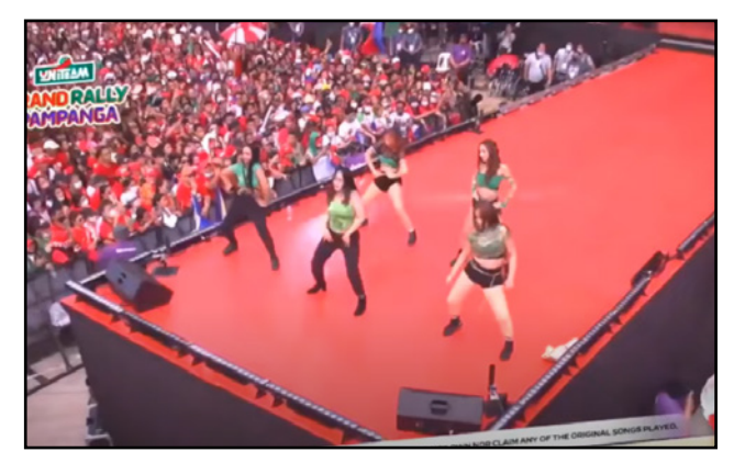
Screenshot grabbed from https://www.youtube. com/watch?v=7I3R7xFNWJA